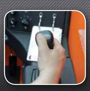
Single Joystick Control boom lift and crowd for more precise positioning.

With a wide cab, adjustable seating and 360-degree visibility, you'll be placing loads in greater comfort.